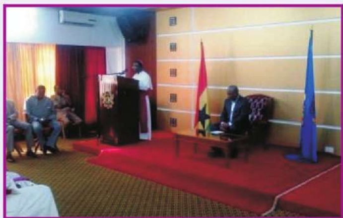
Ghana Catholic Bishops Conference Meeting with President John Dramani Mahama