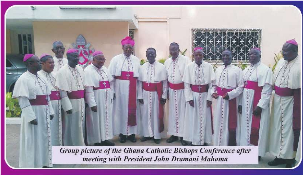
Group picture of the Ghana Catholic Bishops' Conference after meeting with President John Dramani Mahama