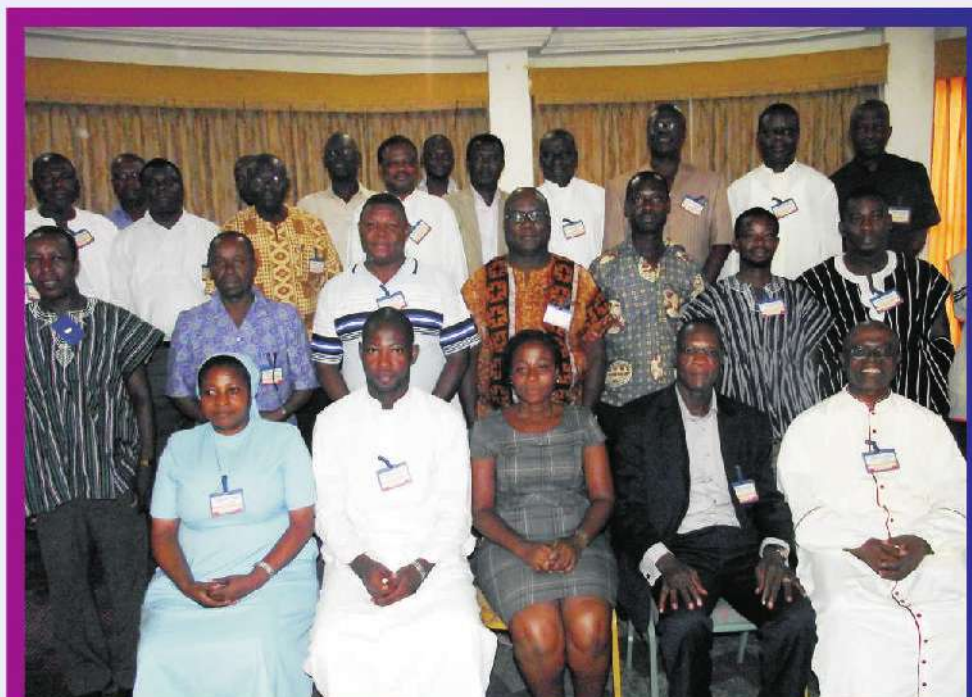
National Briefing and Campaign Validation meeting of Agenda for Right to Health Project