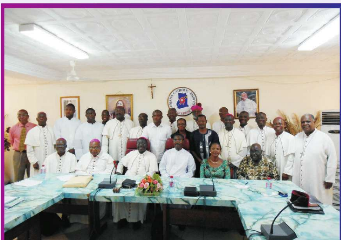
The Ghana Catholic Bishops Conference meets with Constitutional Review Implementation Committee (CRIC)