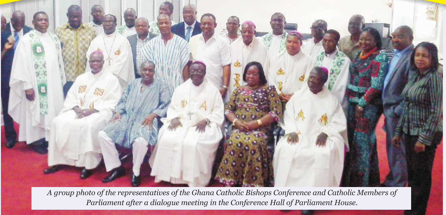
A group photo of the representatives of the Ghana Catholic Bishops Conference and Catholic Members of Parliament after a dialogue meeting in the Conference Hall of Parliament House.